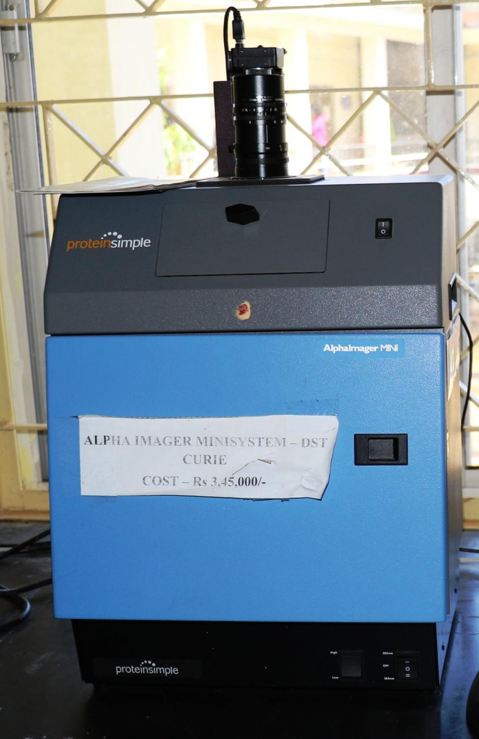
Gel Documentation Unit