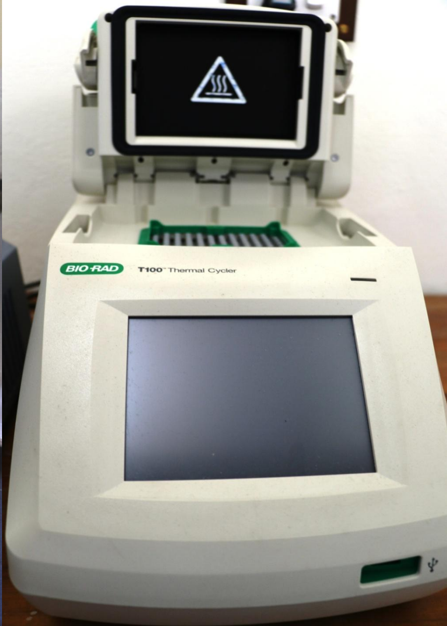
BIO RAD THERMAL CYCLER