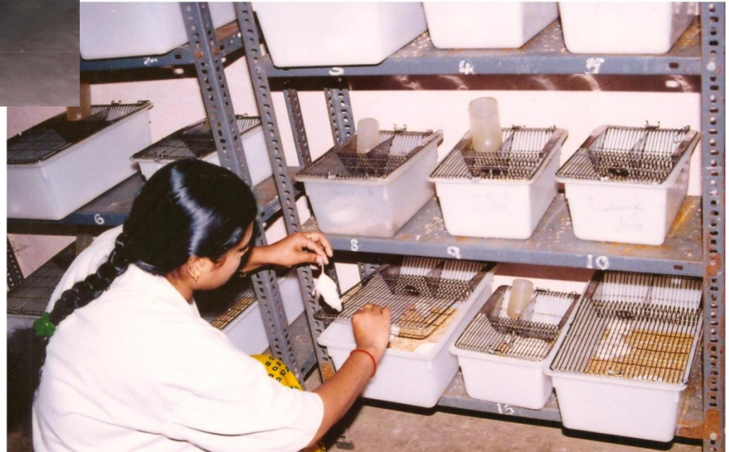
ANIMAL HOUSE FACILITY